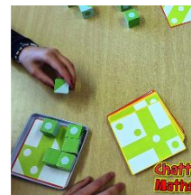
Picture Block Logic