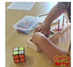
Tower of Hanoi