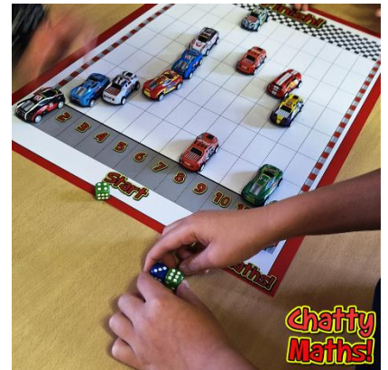
Racing Car Probability