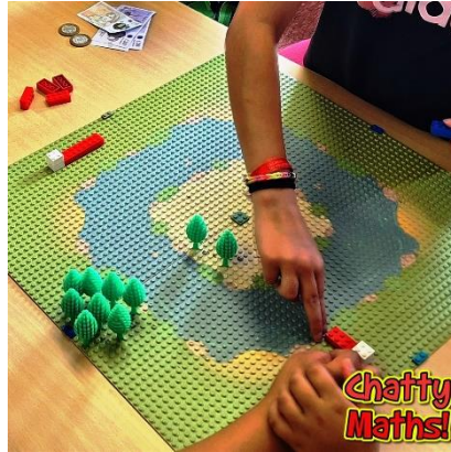
Lego Island Adventure