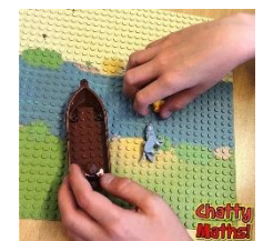
River Crossing Challenges