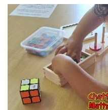
Tower of Hanoi